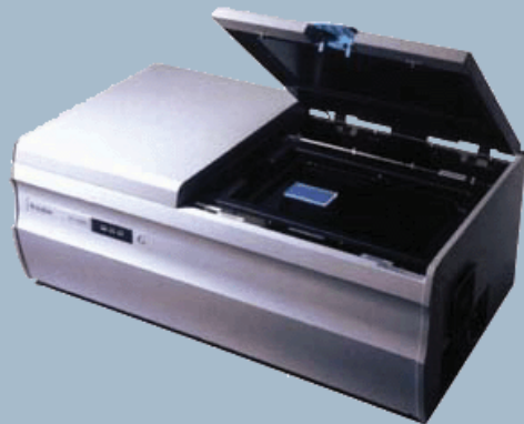
Biological Analysis Systems

Luminit is a world-wide leader in technical innovation in the transmission of light. Our broad product line of Light Shaping Diffusers ® and custom designed solutions can be tailored to your most exacting needs. Following is a list of a few of our products that are used in biomedical instrumentation: