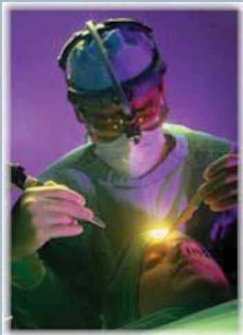
Cosmetic Laser Surgery

Today's medical instrumentation includes a wide selection of light sources from fluorescent fixtures to UV sources to lasers for applications from general lighting to laser surgery and everything in between. Each light source and each application requires optics that will provide directionality and uniformity with minimum loss of light. Luminit provides a large array of Light Shaping Diffuser ® products that work from 200nm to 1600nm with transmission efficiencies that can exceed 90%.